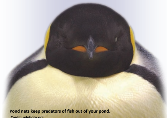
Pond nets keep predators of fish out of your pond.